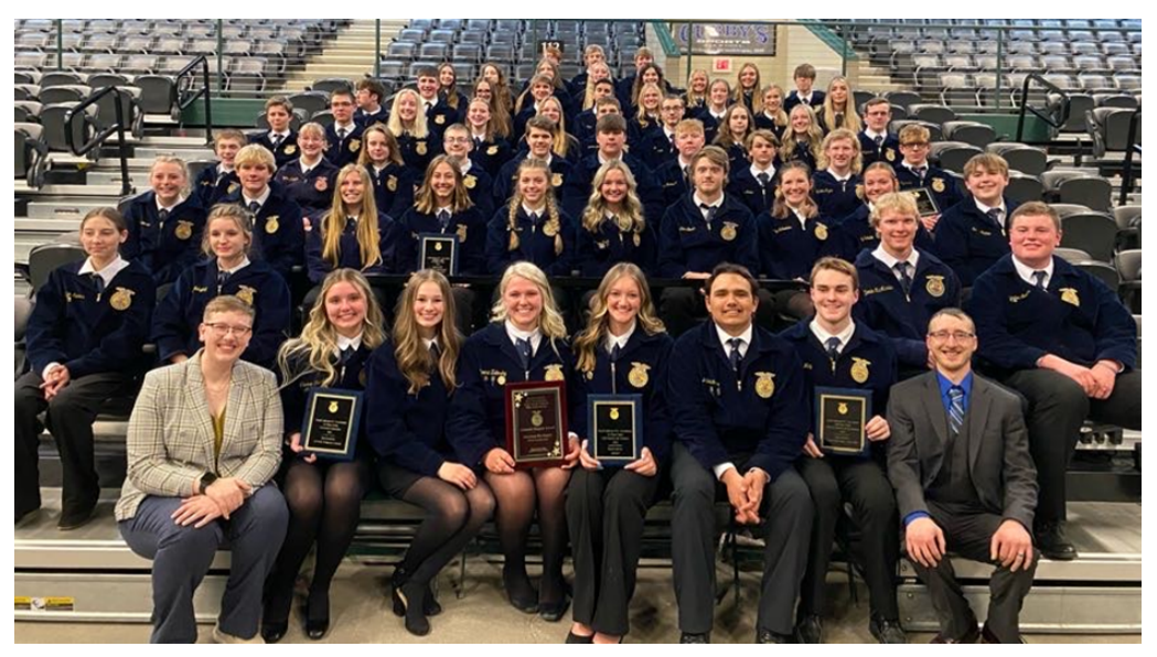
Brookings FFA Chapter attending the 95th State FFA Convention

FFA Convention. FFA's Career Development Events are built around ag industry careers, expose members to many of the opportunities and needs in the agriculture sector, and enable them to develop and refine their abilities to critically evaluate, effectively communicate and ultimately, succeed in future careers.