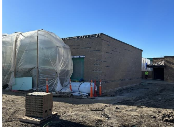
ECE Exterior: Brick work moving along well.