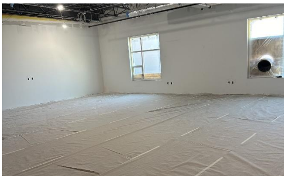
Art Room: Sheetrock, Tape, Mudded and Primed.

Interior: With the building closed up crews have been able to run some temporary heat and begin the process of interior finishes. Sheetrocking, mudding and tapping has begun moving west to east with completion in the administrative spaces, music, art, counseling technology and behavior wing. Paint in these spaces is scheduled to begin before we head into winter break as well. The eastern side of the new building continues to have walls and rooms take shape as well as rough ins for plumbing and electrical.