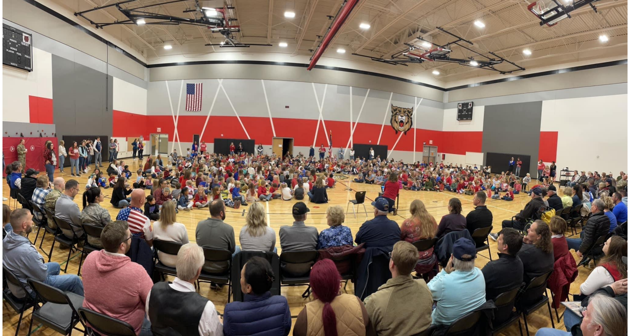
2023 Veteran's Day Program